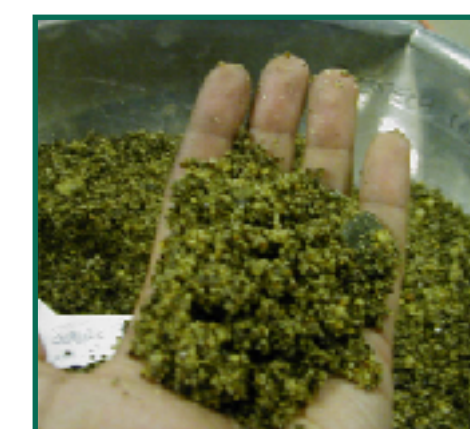
Close-up of the coarse sand-compost media used in the tree box filter. This 76% coarse sand / 24% compost mixture has 10% organic matter and infiltrates water at a rate of 14.6 inches/hour in the laboratory.

Treatment Functions Physical-Chemical and Biological, Filtration