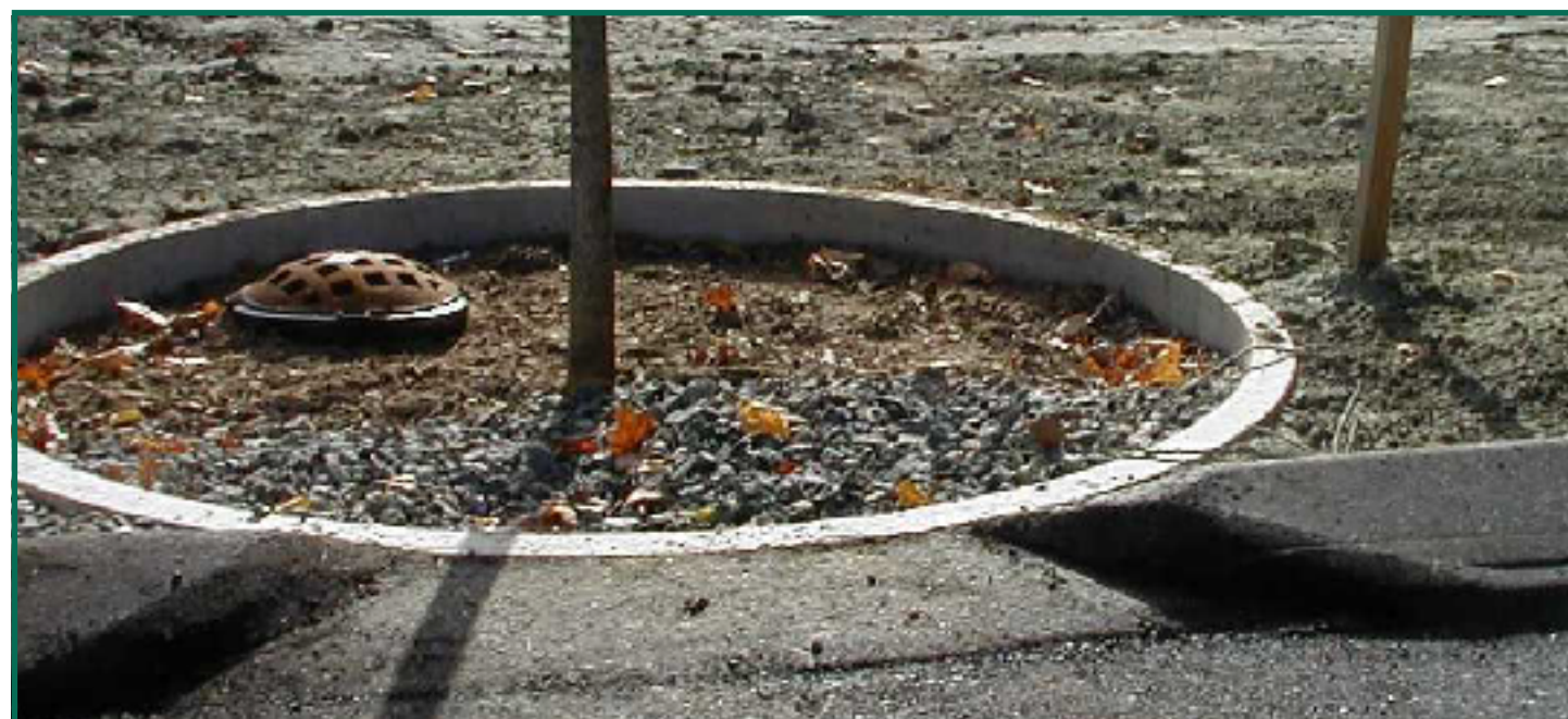
Tree box filter after installation. The inlet, overflow and berm are not complete in this photo.