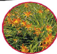
6 Stella de Oro Daylily ( Heemerocallis 'Stella de Oro' )