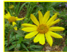
4 Western Sunflower ( Helianthis occidentalis )