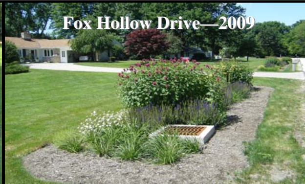
Fox Hollow Drive—2009