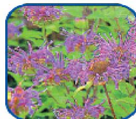
2 Bee Balm; Bergamont ( Monarda fistula )