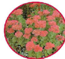
8 Autumn Joy Sedum ( Sedum x 'Autumn Joy' )